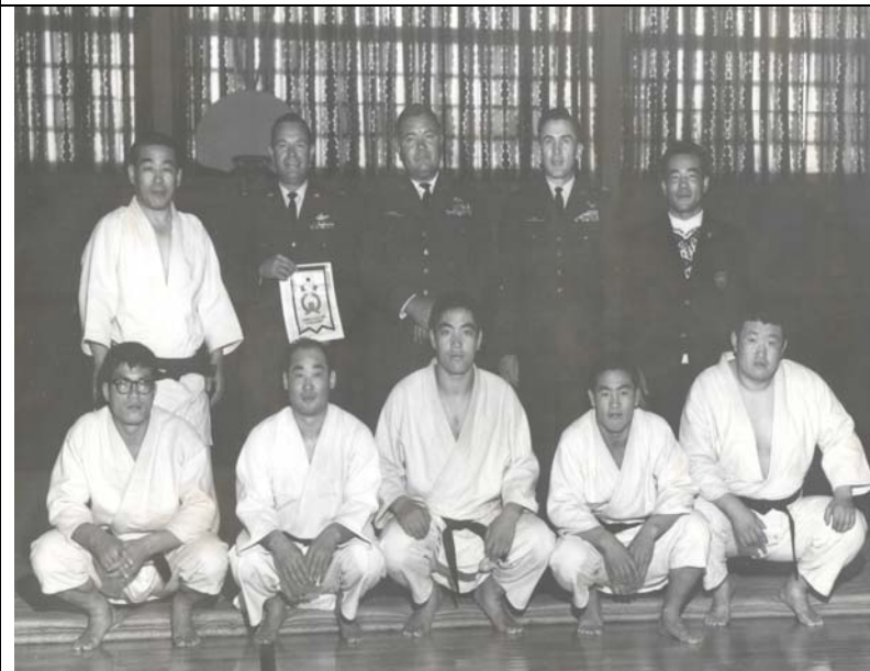
1965 Korean National Team at Air Force Gym