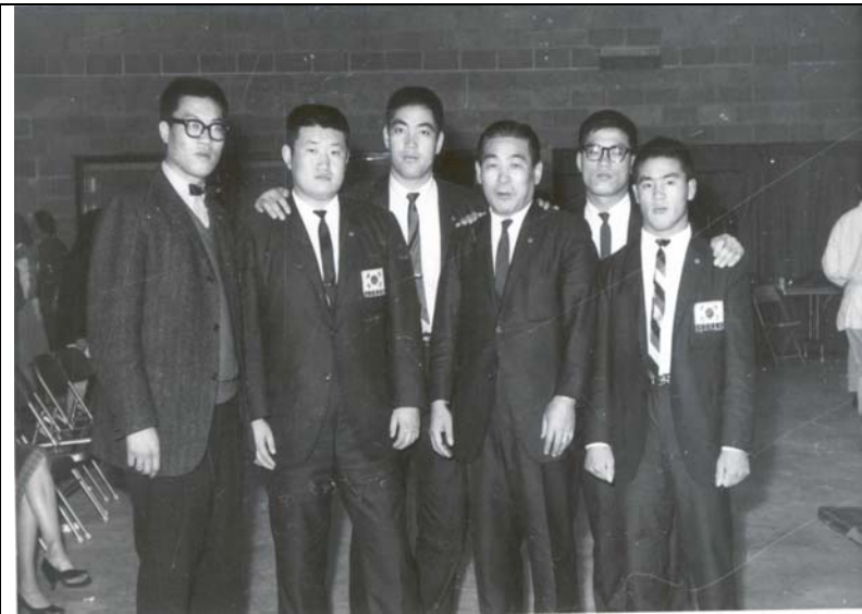
1965 Korean National Team visiting Indianapolis