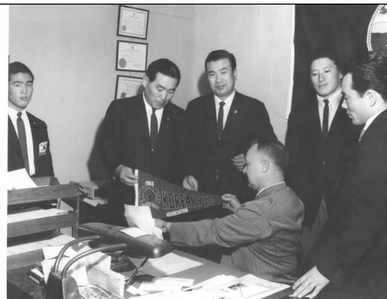
Courtesy Visit to Sheriff's Office