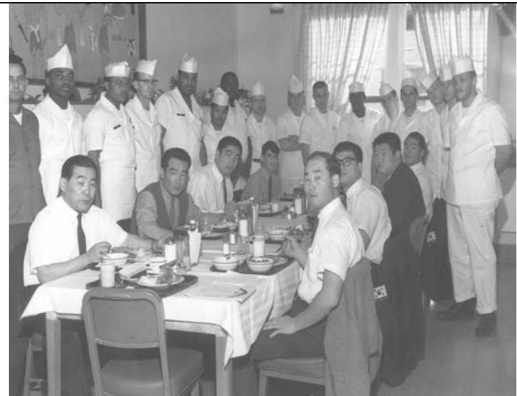
National Team with Air Force Base in Topeka, Kansas